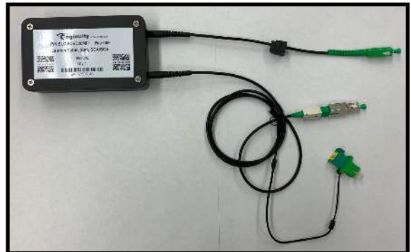
Fixed Ruggedized Launch Cable Assembly

The ELC is engineered for long service life by incorporating robust micro-armored jumper cordage for improved durability during day-to-day usage. The shuttered, device under test (DUT) SC/APC connector helps protect the connector endface when not connected to equipment. Adding a female-male SC adapter onto the DUT pigtail (included) enables the swap-out of only the adapter should connector endface damage occur; reducing the interval between launch cable replacement.