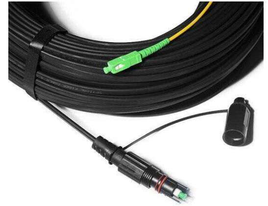
SC/APC Hardened Connector to SC/APC Connector (shown)

Engenuity Fiber Drop Cable assembly features an OptiTap® compatible hardened connector or a standard SC/APC connector on either end to provide a turn-key solution for terminated drops in FTTx applications. Drop cable available in standard oval flat drop or compact Micro-Flat Drop cable. With or without tone wire.