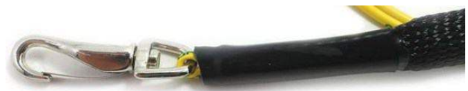
Fiber Sock / Pull-eye

OptiTap is a registered trademark of Corning.